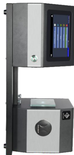
Vertical haze measurement